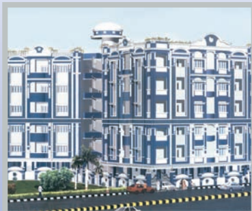
M.B's De Royale, Hyderabad