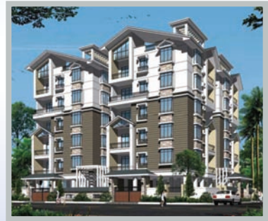
Sahitha Abode, Secunderabad