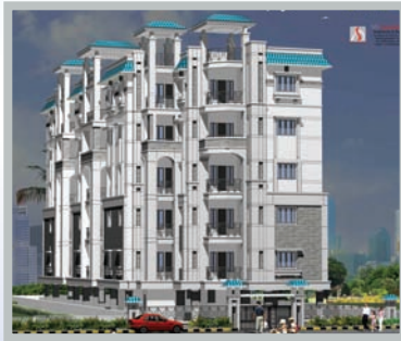
Divya Splendour, Bangalore