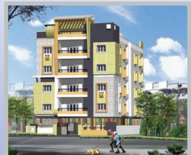
Suma Splendour, Hyderabad