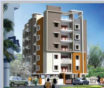
Vinayaka Abode, Secunderabad