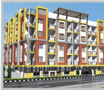
Radiant Castle, Bangalore