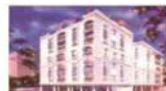
SKV's Adams Arcade