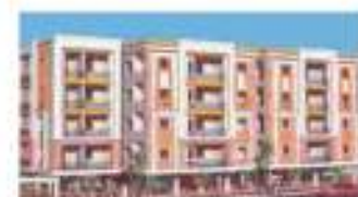
SKV's Royal Pavilion