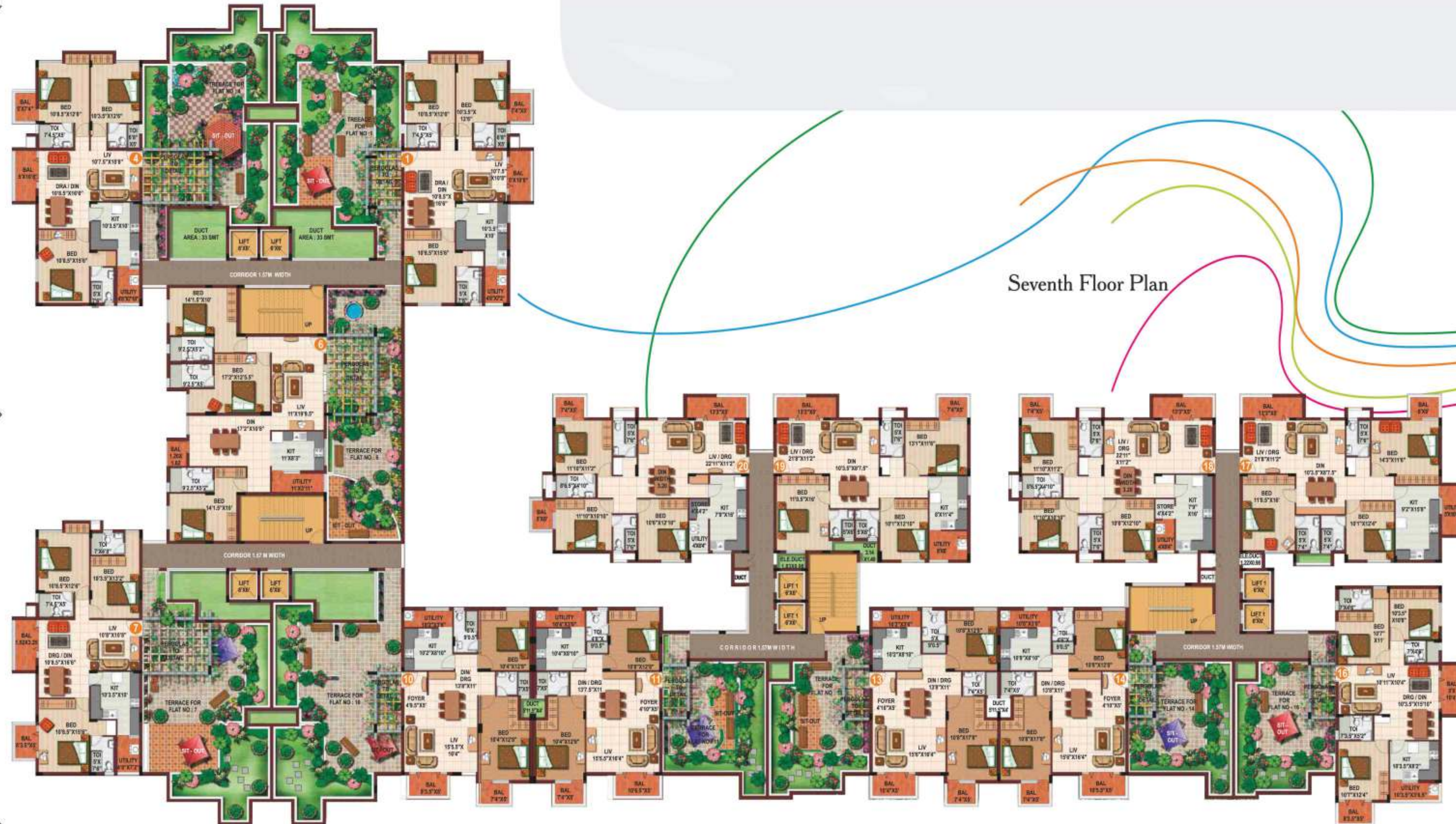
Seventh Floor Plan