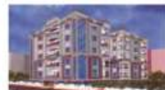
SKV's Sulochana Sadan