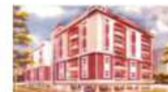
SKV's Park View