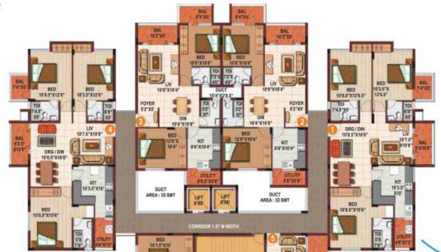
Typical Floor Plan (2nd to 6th floor)